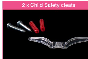
2 x Child Safety cleats